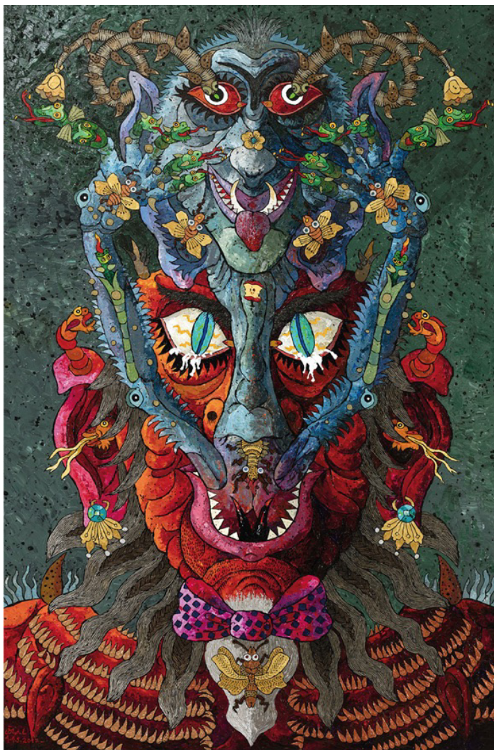
Ali Akbar Sadeghi. "Diplomat". 2017 Acrylic on Canvas. 150 × 100 cm