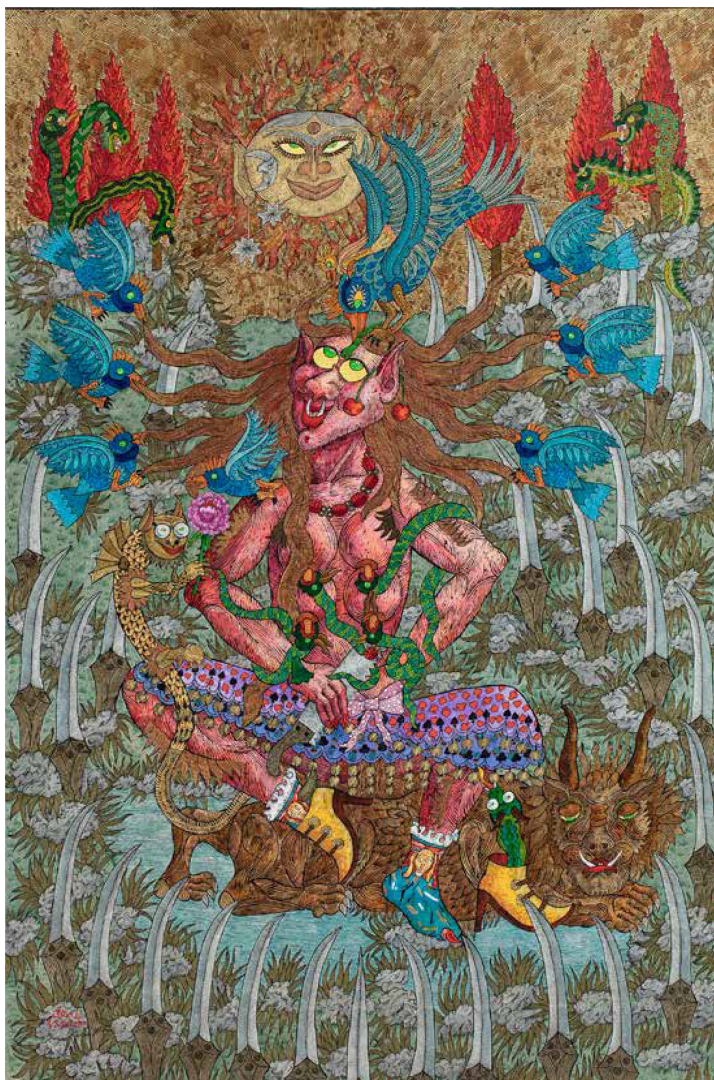
Ali Akbar Sadeghi. "Daughter". 2019 Acrylic on Canvas. 150 x 100 cm