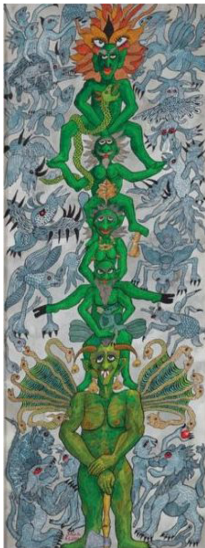
Ali Akbar Sadeghi. "N/A". 2023 Acrylic and ink on canvas. 131.5 x 59 cm