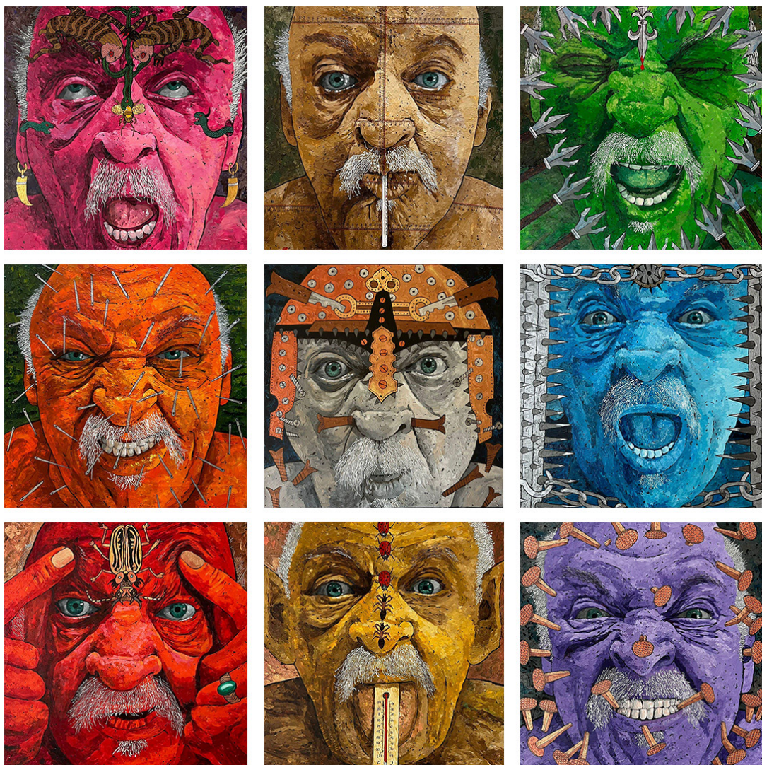
Ali Akbar Sadeghi. "Mad" 2022 Acrylic on Canvas. Each Piece: 60 x 60 cm