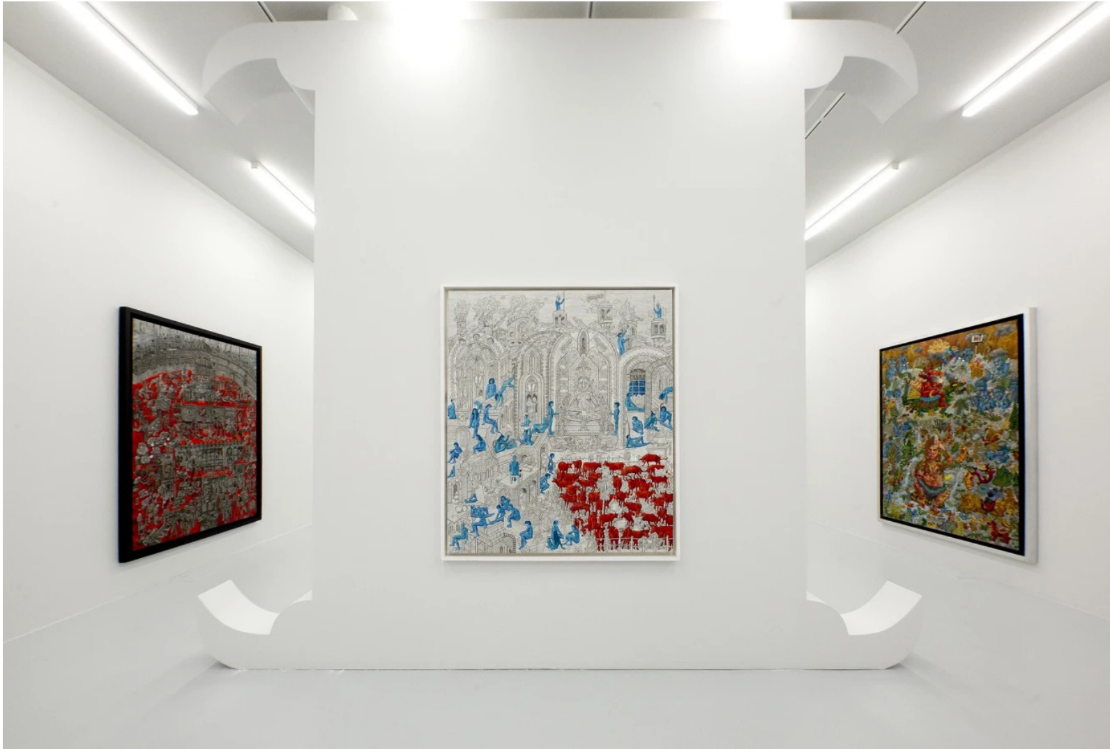
Installation view of Mad Parallel Circuit. Tehran, Iran