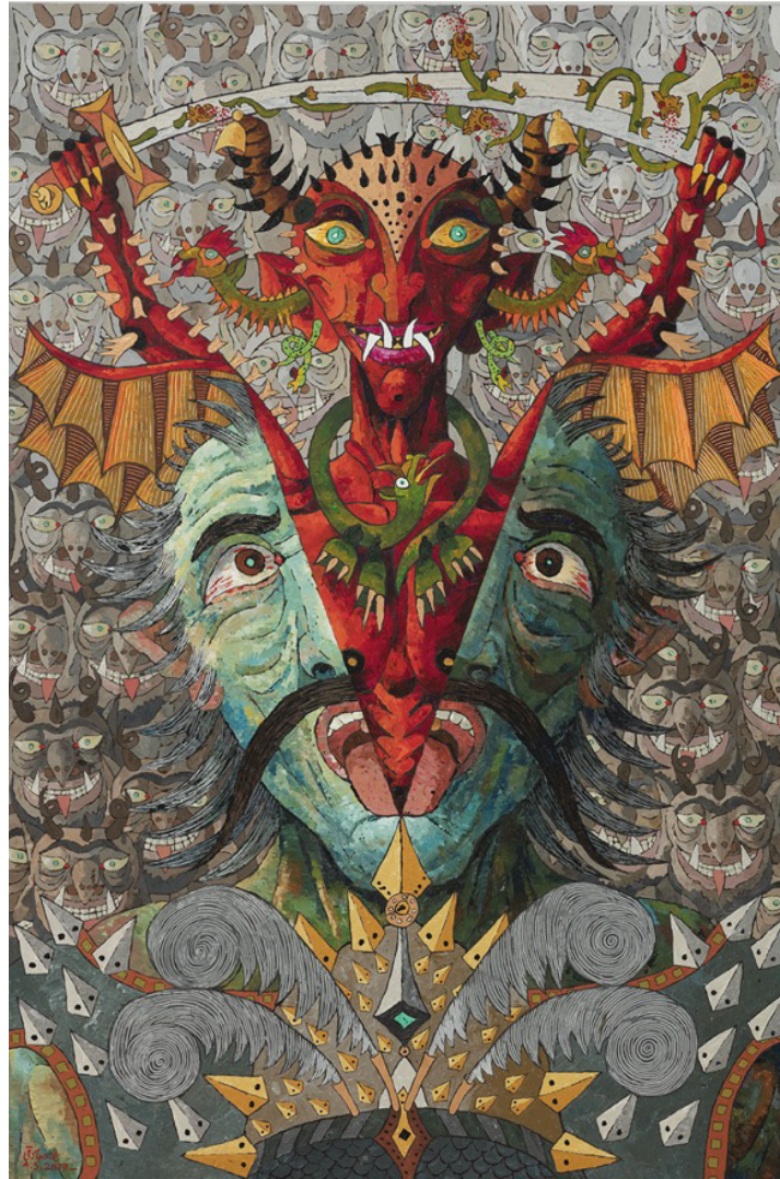
Ali Akbar Sadeghi. "Winner". 2017 Acrylic on Canvas. 150 × 100 cm