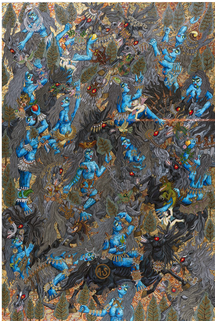
Ali Akbar Sadeghi. Blue from "Demon" Series. 2021 Acrylic and Ink on Canvas. 200 x 150 cm