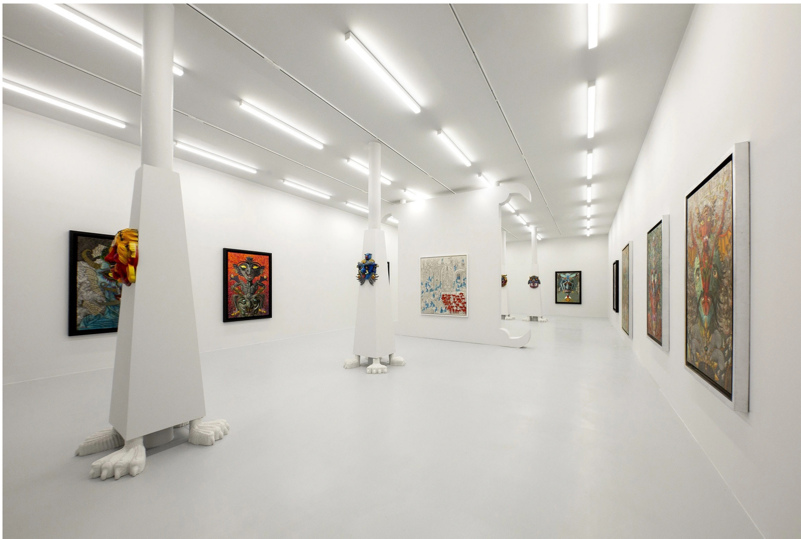
Installation view of Mad Parallel Circuit. Tehran, Iran