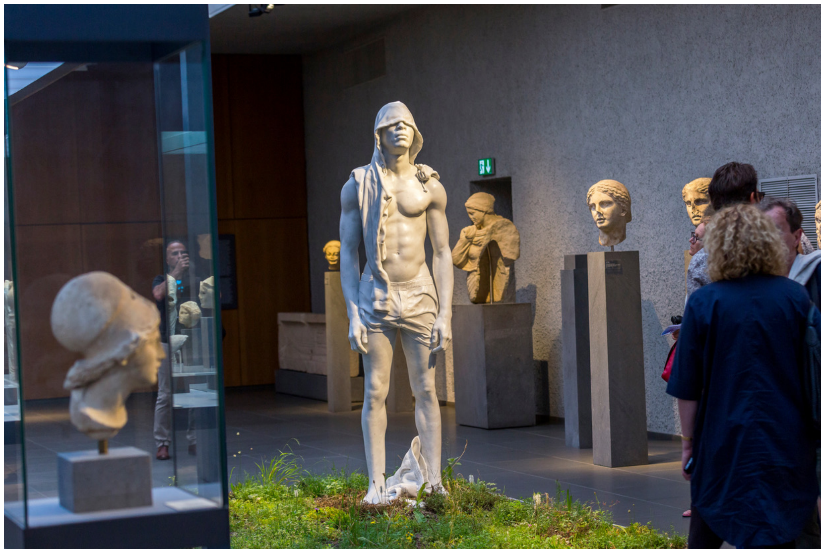
Installation View, Reza Aramesh at Art Basel Parcours, 2017