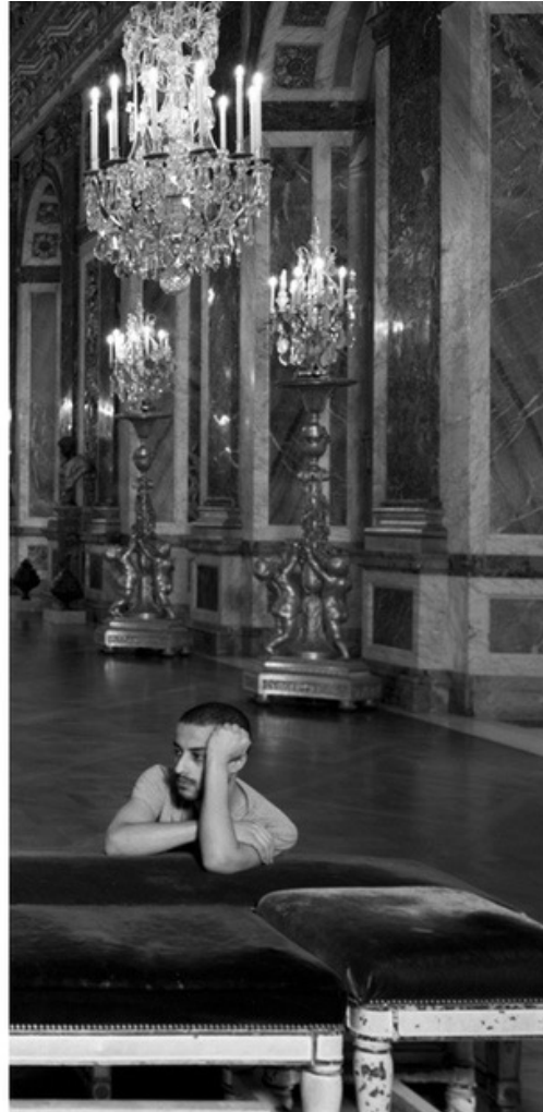
Reza Aramesh "Action 110: Wednesday 8 January 2009. A man sits beside the body of two youths killed. Gaza City." 2011 Silver gelatin print mounted on aluminum and archival board, framed. Triptych 195 x 270 cm