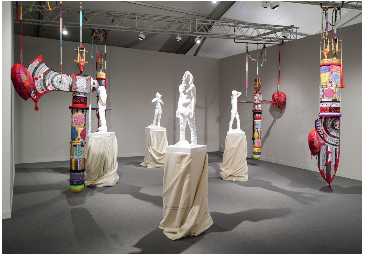
Installation View, Reza Aramesh & Homa Delvaray, Presented by Dastan Gallery, Frieze London, 2022