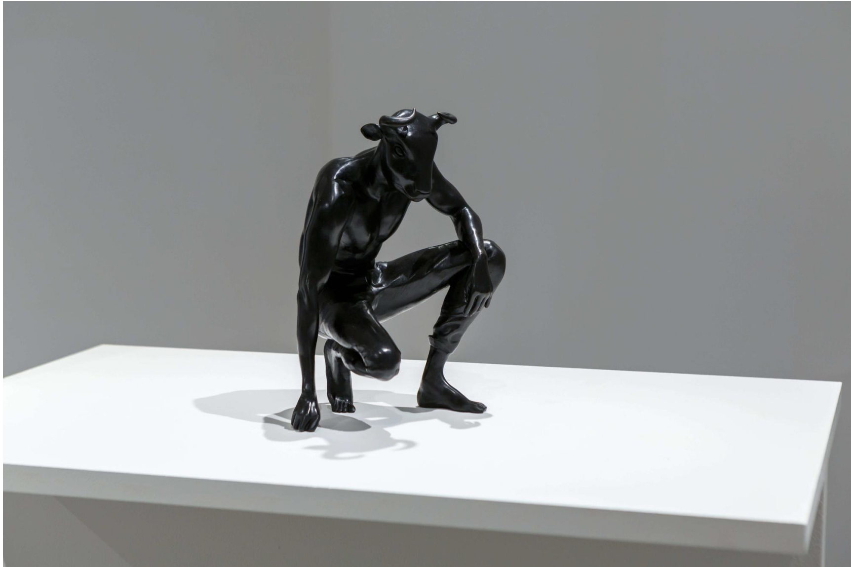
Reza Aramesh "Metamorphosis - a study in liberation." Action 183", 2016 Bronze 32 x 24 x 18 cm