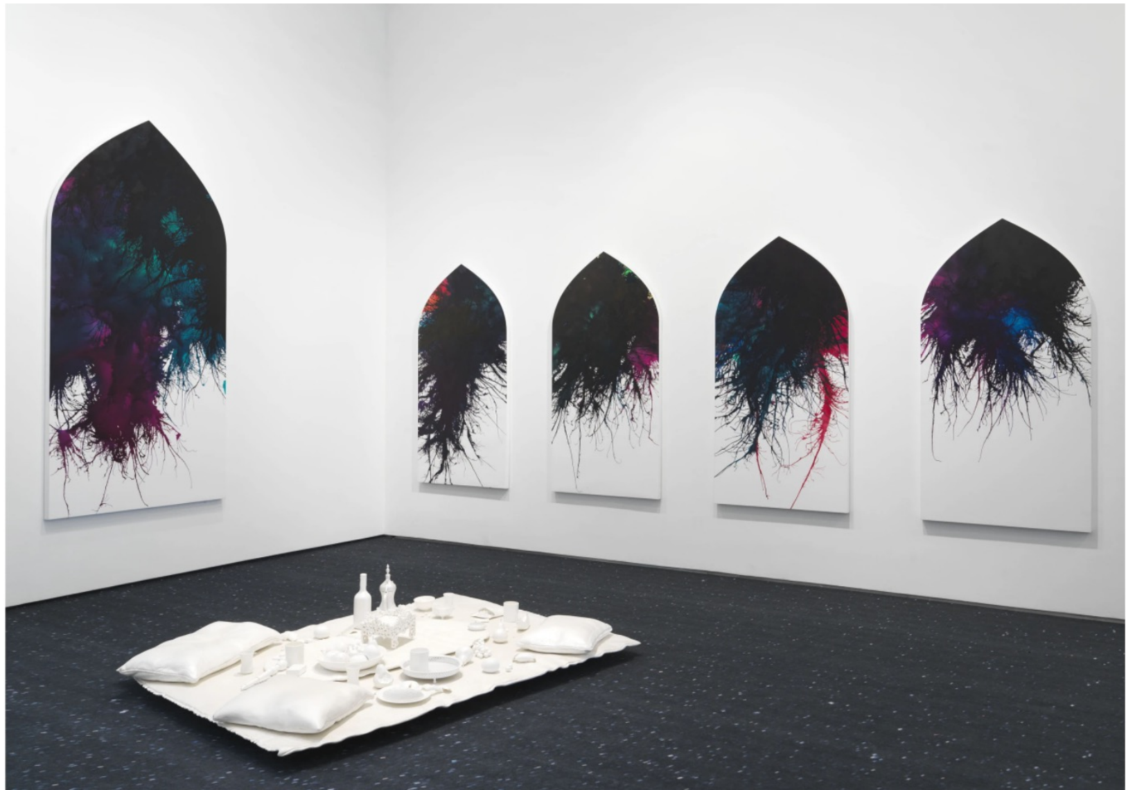
Installation View Homesick Marianne Boesky Gallery, 2019