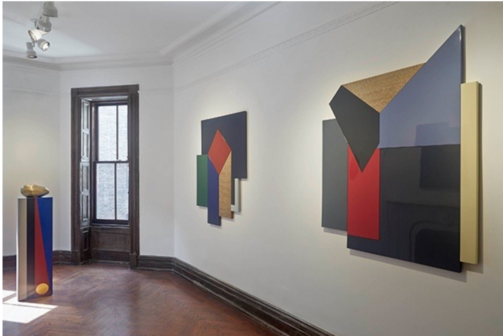
Installation View Marianne Boesky Gallery, 2015