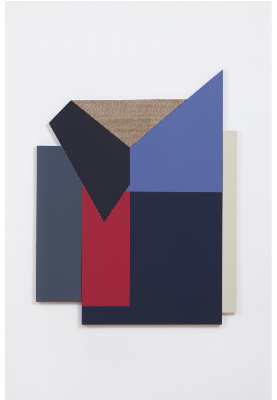
Andisheh Avini Untitled , 2015 Lacquer, Wood and Marquetry 141 x 110.5 x 3.2 cm