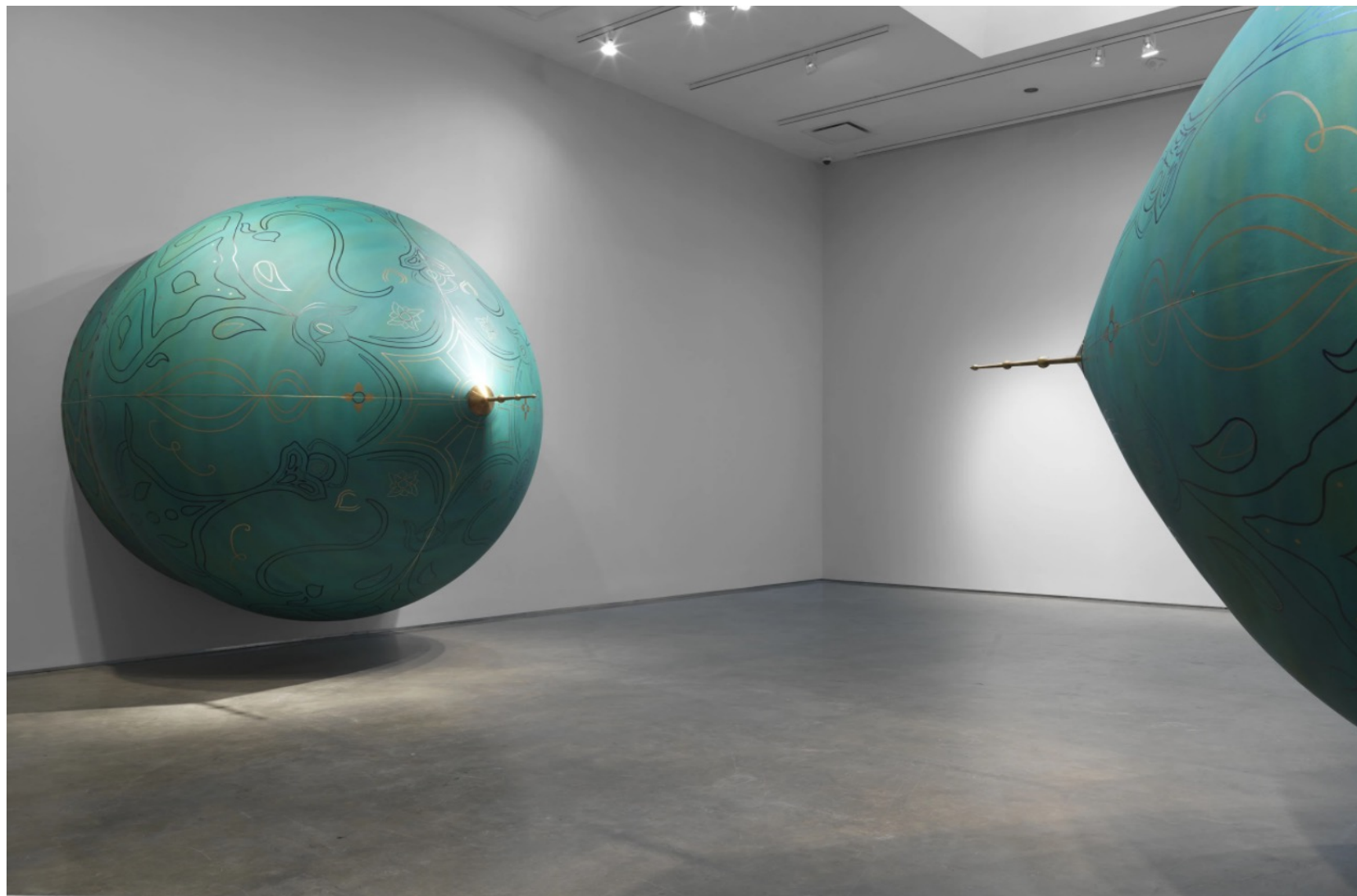
Installation View Homesick Marianne Boesky Gallery, 2019