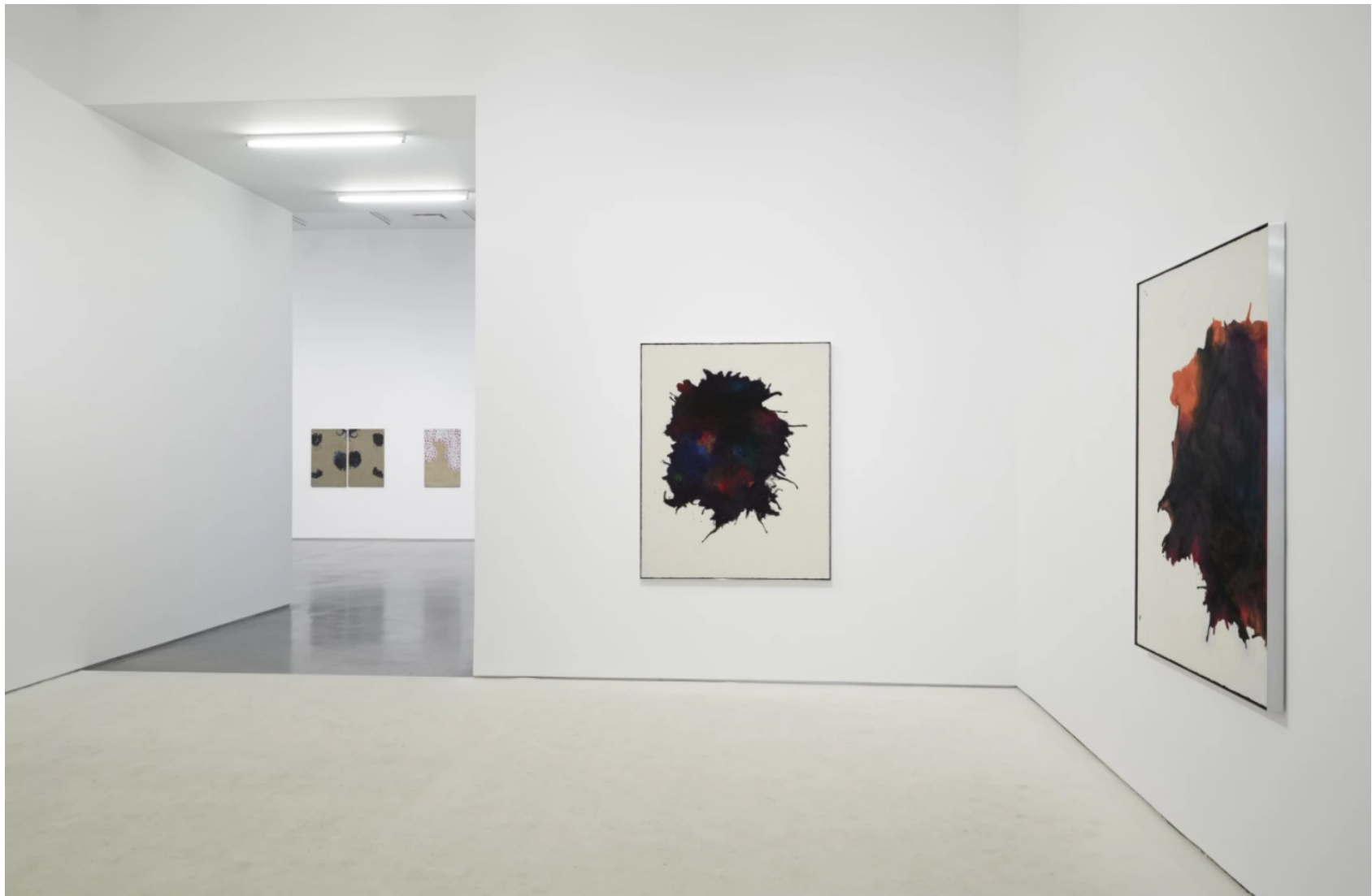
Installation View Marianne Boesky Gallery, 2014