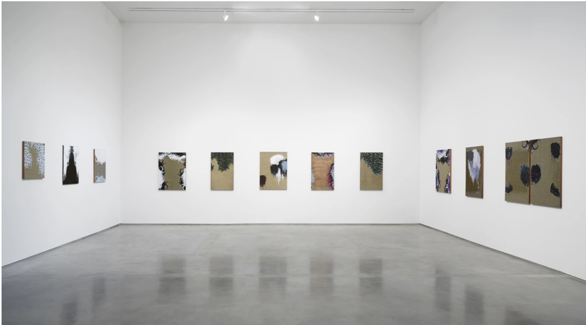
Installation View Marianne Boesky Gallery, 2014