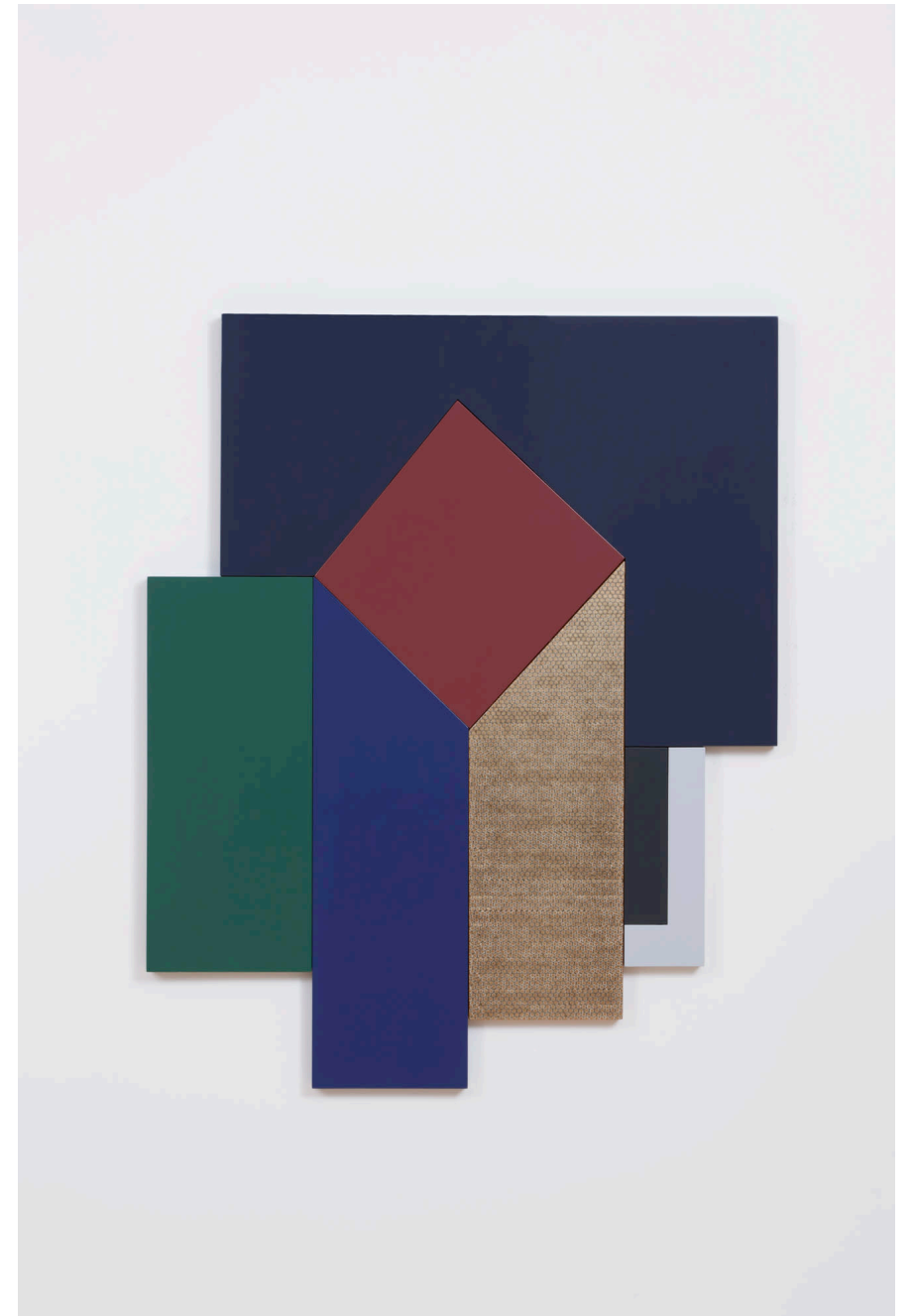
Andisheh Avini Untitled , 2015 Lacquer, Wood, and Marquetry 129 x 105.4 x 3.2 cm