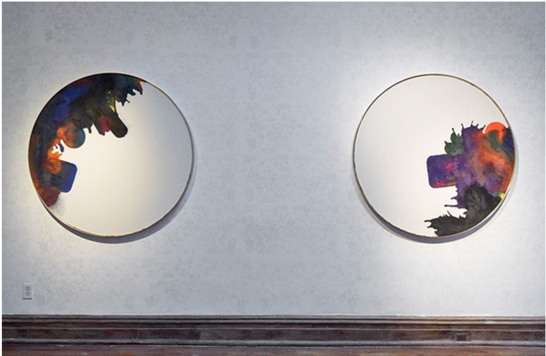
Installation View Marianne Boesky Gallery, 2015