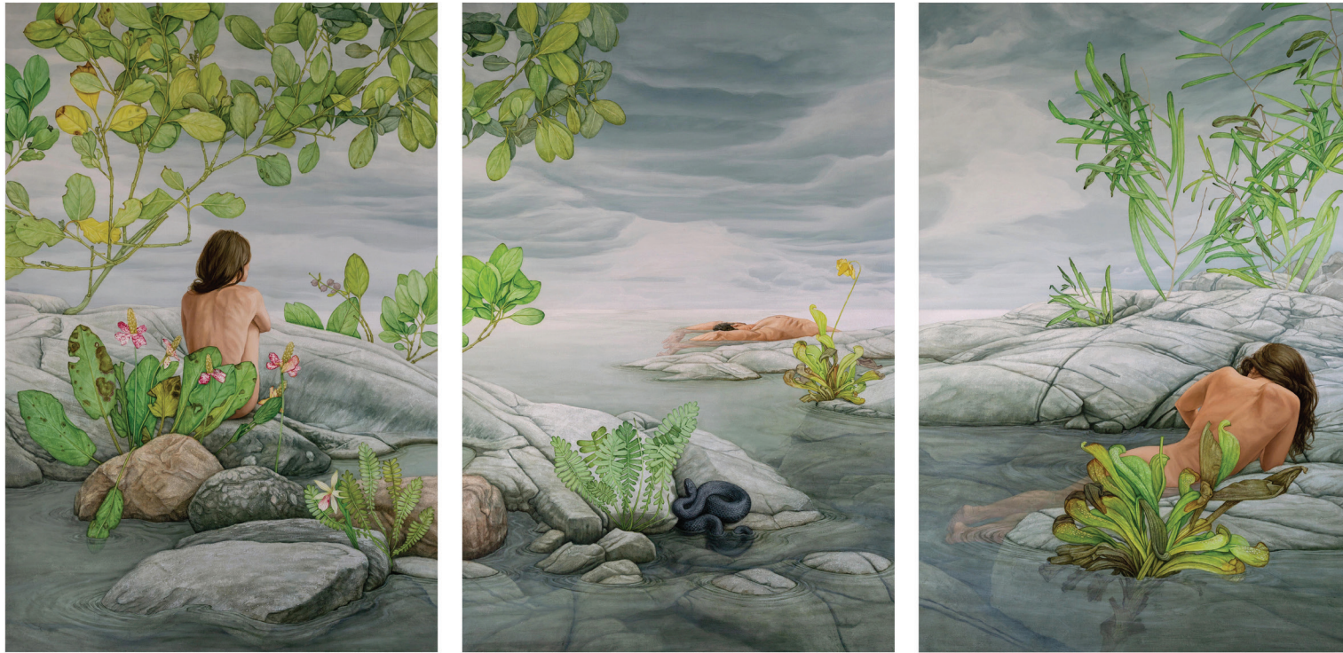
< Morteza Pourhosseini Pale Vision 2025 Oil and acrylic on canvas Triptych: 150 x 300 cm

Morteza Pourhosseini, meanwhile, engages with biblical references in his allegorical canvases. His scenes of the Garden of Eden depict nude figures with their backs turned, wandering as if estranged from their origins. The figures are not heroic nor even centrally placed; rather, they appear lost, their gestures subdued, their postures hesitant. This subtle decentering transforms a canonical story into a meditation on vulnerability, exile, and the fragile search for belonging. Pourhosseini's Eden is less a paradise than a mirror for human bewilderment.