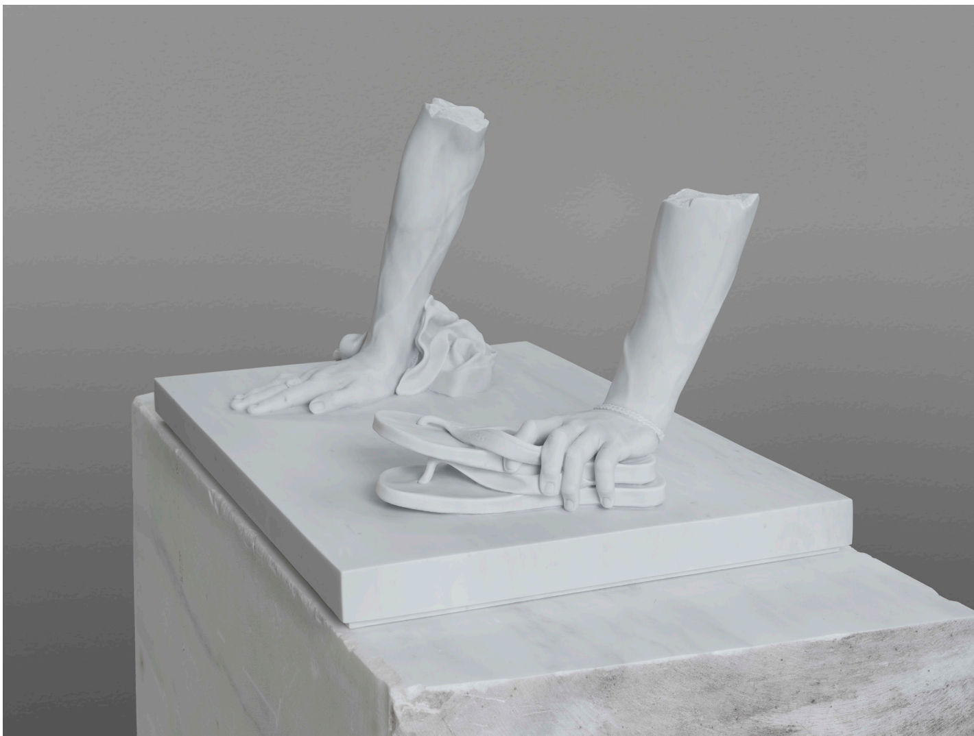
Reza Aramesh. "Action 703: At 12:45 pm Monday 09 October 2017". 2025 Hand-carved and polished Bianco P marble. 74.5 × 58 × 44 cm (Image 4/4)