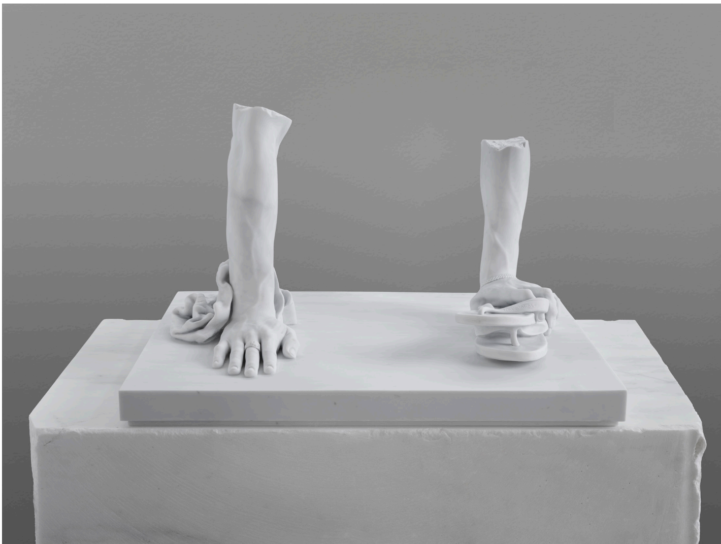
Reza Aramesh. "Action 703: At 12:45 pm Monday 09 October 2017". 2025 Hand-carved and polished Bianco P marble. 74.5 × 58 × 44 cm (Image 3/4)