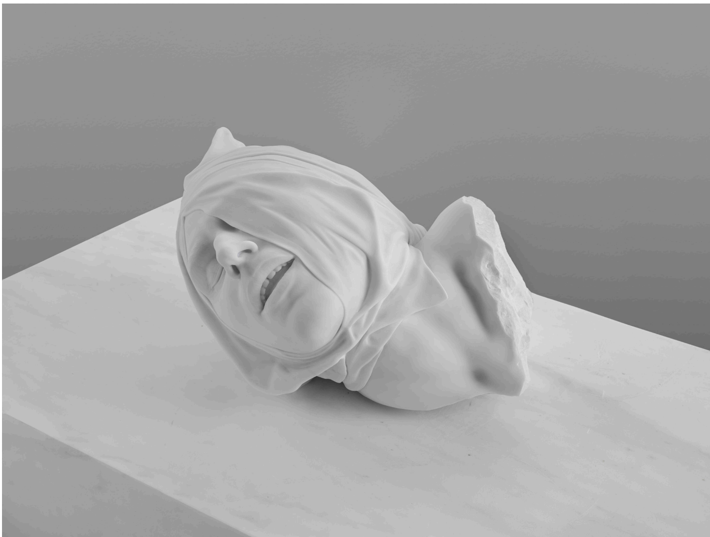
Reza Aramesh. "Action 608: At 5:06 am Tuesday 14 April 2015". 2025 Hand-carved and polished Bianco P marble. 55 × 33 × 28 cm (Image 1/4)