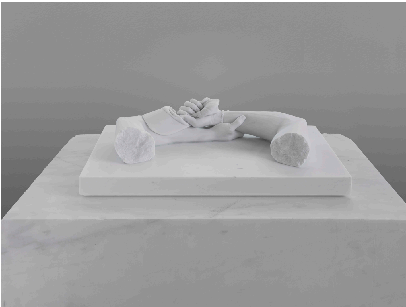
Reza Aramesh. "Action 702: At 11:50 am Wednesday 08 January 2014". 2025 Hand-carved and polished Bianco P marble. 75 × 41 × 19.3 cm (Image 2/5)