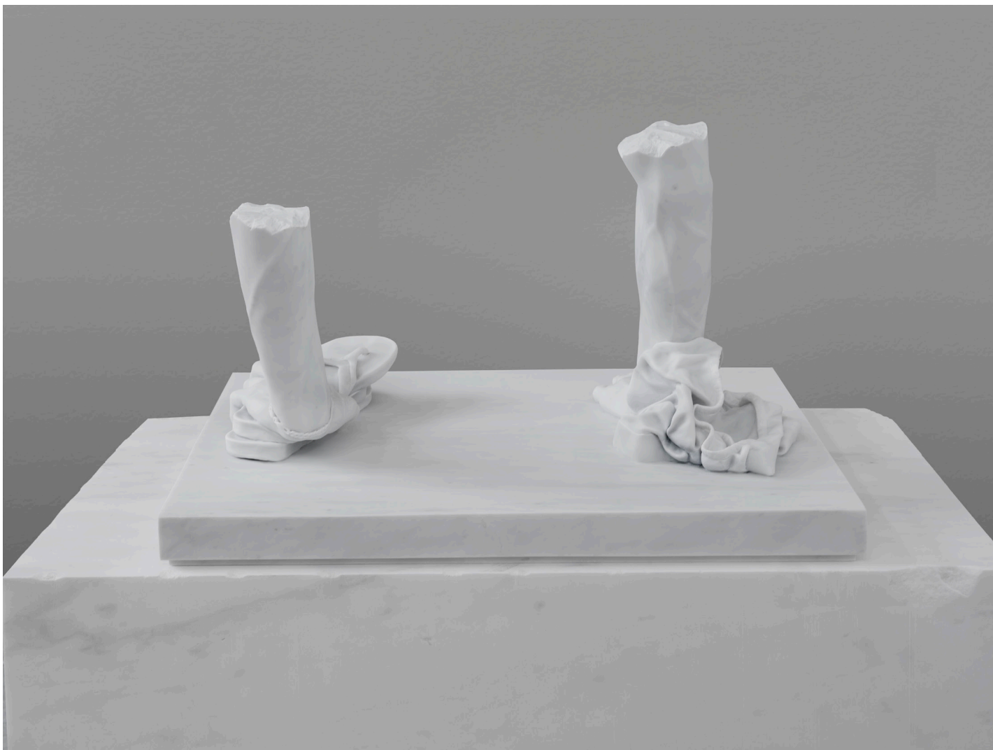
Reza Aramesh. "Action 703: At 12:45 pm Monday 09 October 2017". 2025 Hand-carved and polished Bianco P marble. 74.5 × 58 × 44 cm (Image 2/4)