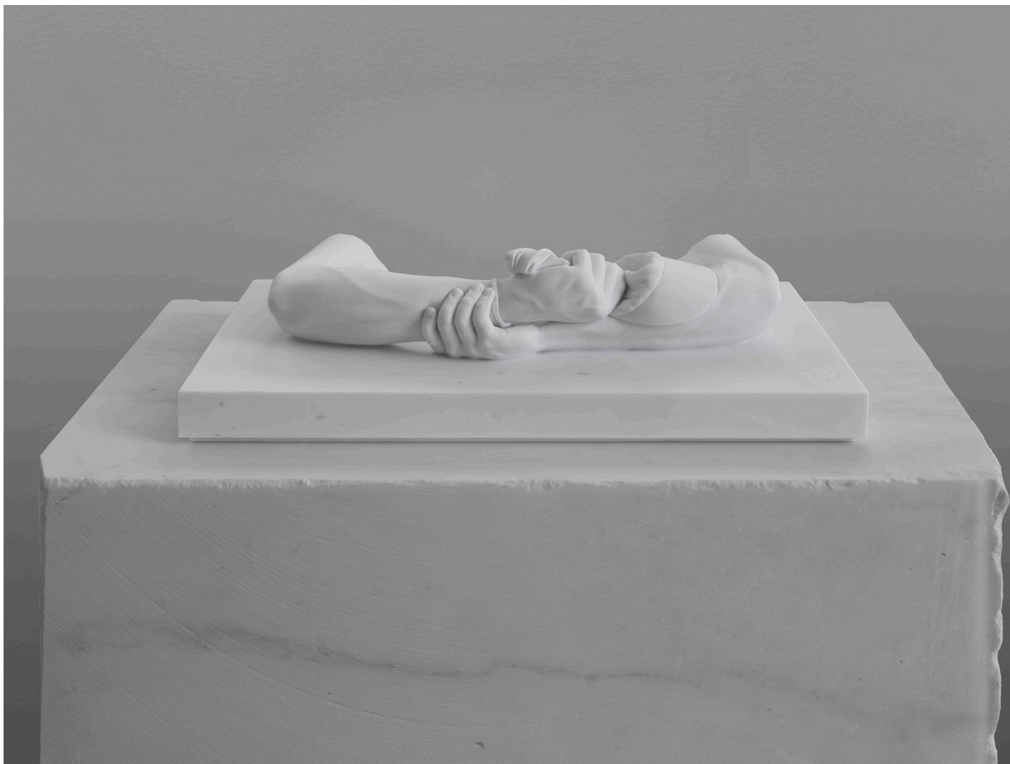
Reza Aramesh. "Action 702: At 11:50 am Wednesday 08 January 2014". 2025 Hand-carved and polished Bianco P marble. 75 × 41 × 19.3 cm (Image 4/5)