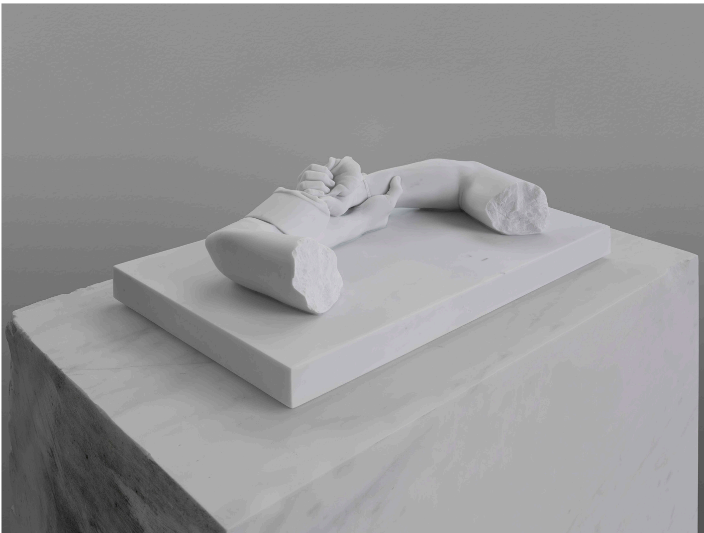
Reza Aramesh. "Action 702: At 11:50 am Wednesday 08 January 2014". 2025 Hand-carved and polished Bianco P marble. 75 × 41 × 19.3 cm (Image 1/5)