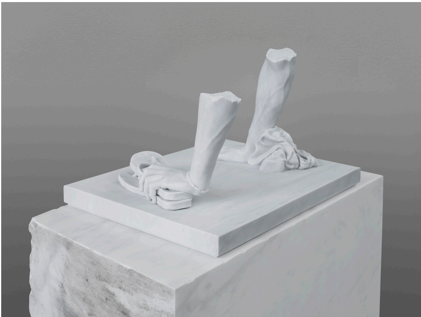
Reza Aramesh. "Action 703: At 12:45 pm Monday 09 October 2017". 2025 Hand-carved and polished Bianco P marble. 74.5 × 58 × 44 cm (Image 1/4)