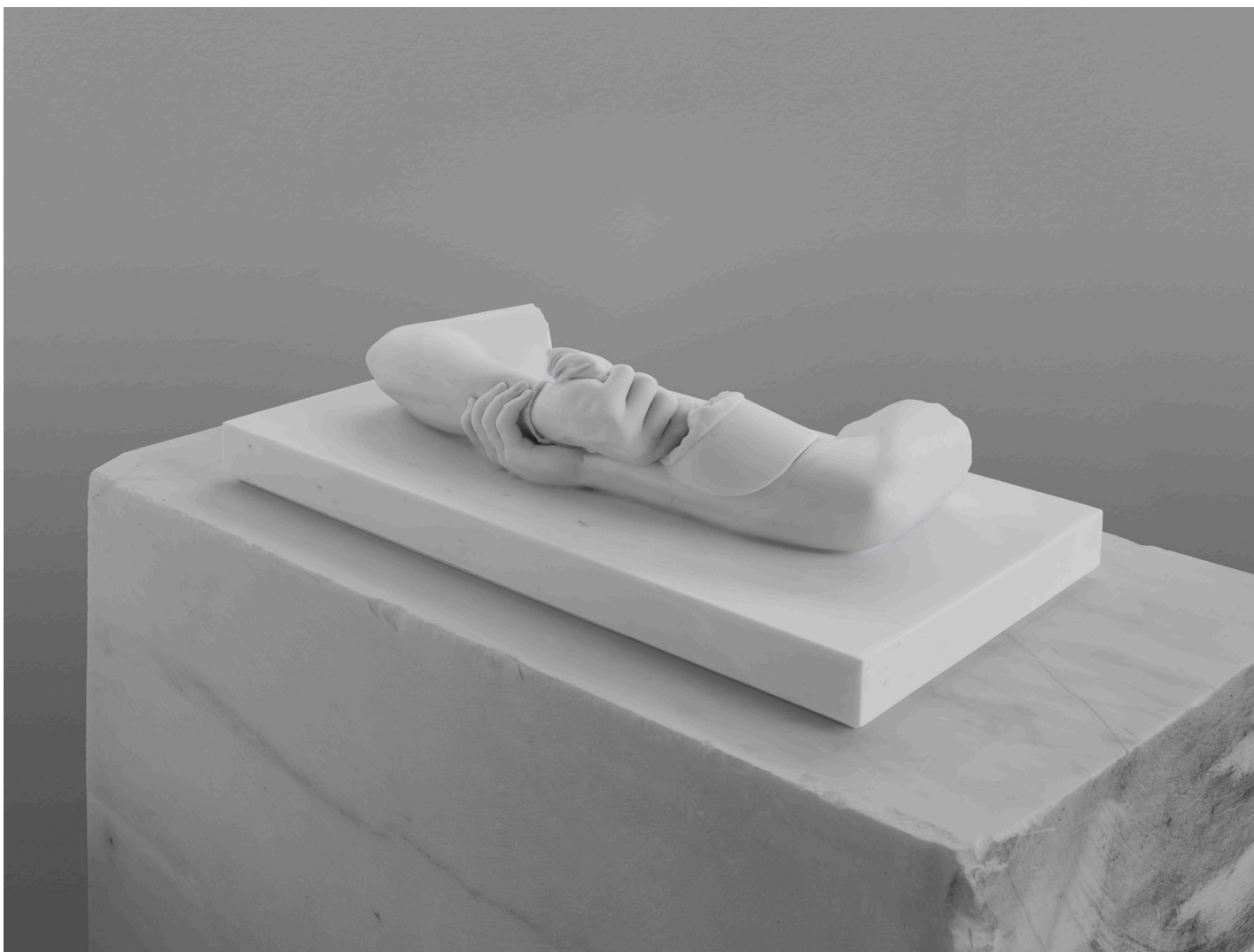
Reza Aramesh. "Action 702: At 11:50 am Wednesday 08 January 2014". 2025 Hand-carved and polished Bianco P marble. 75 × 41 × 19.3 cm (Image 5/5)