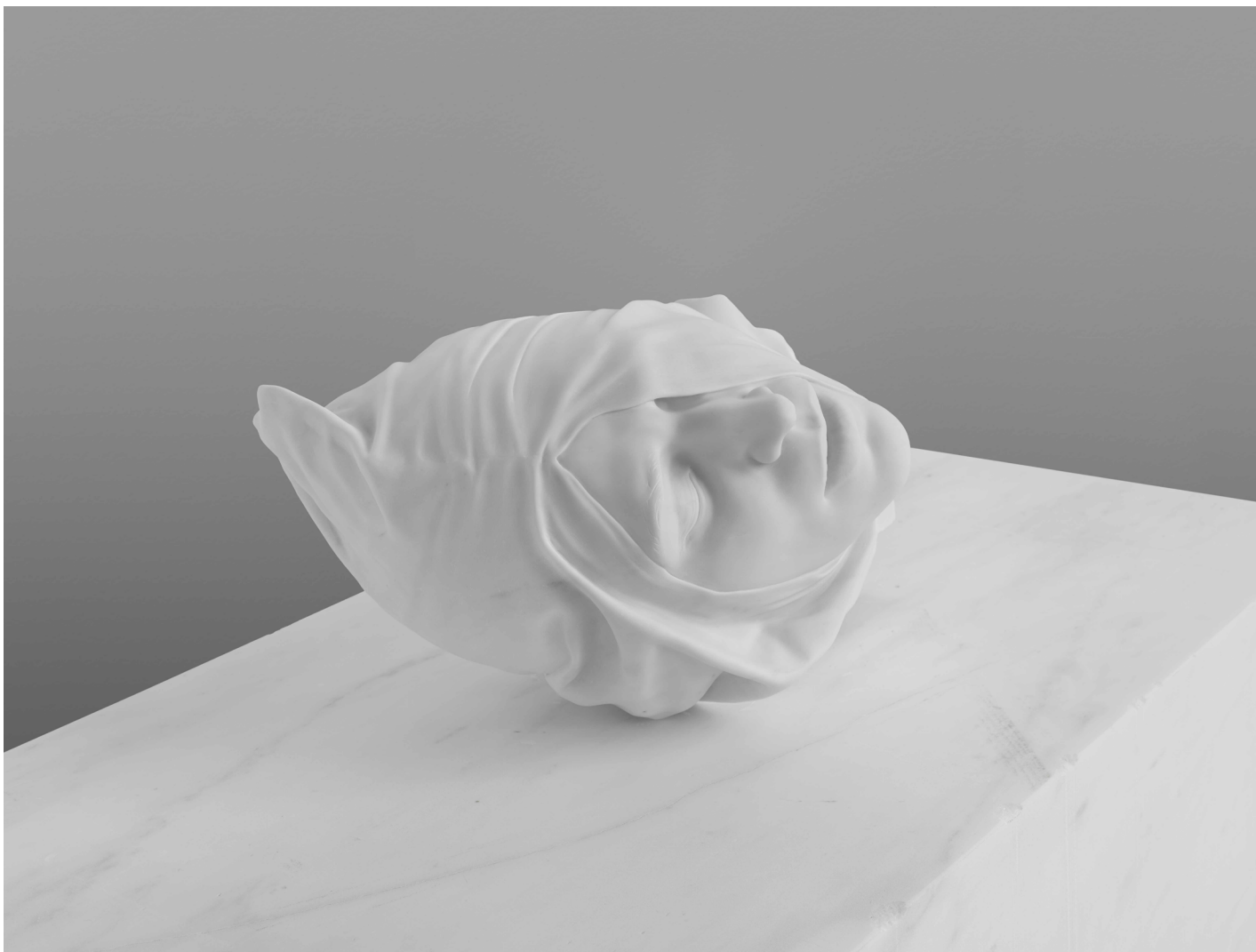
Reza Aramesh. "Action 608: At 5:06 am Tuesday 14 April 2015". 2025 Hand-carved and polished Bianco P marble. 55 × 33 × 28 cm (Image 3/4)