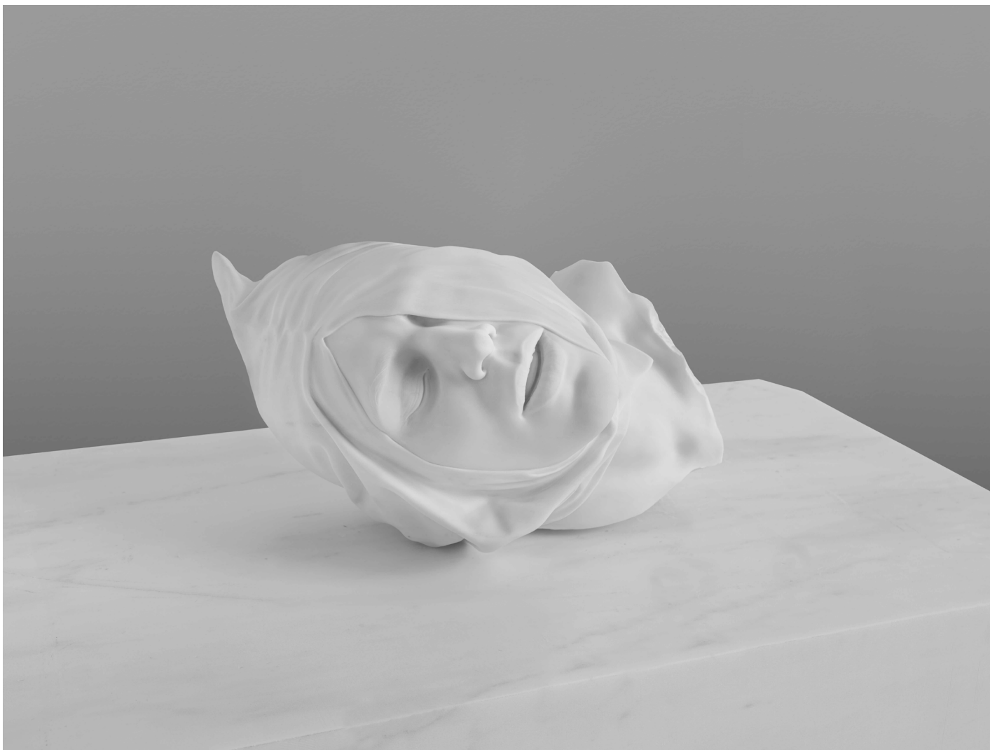
Reza Aramesh. "Action 608: At 5:06 am Tuesday 14 April 2015". 2025 Hand-carved and polished Bianco P marble. 55 × 33 × 28 cm (Image 2/5)