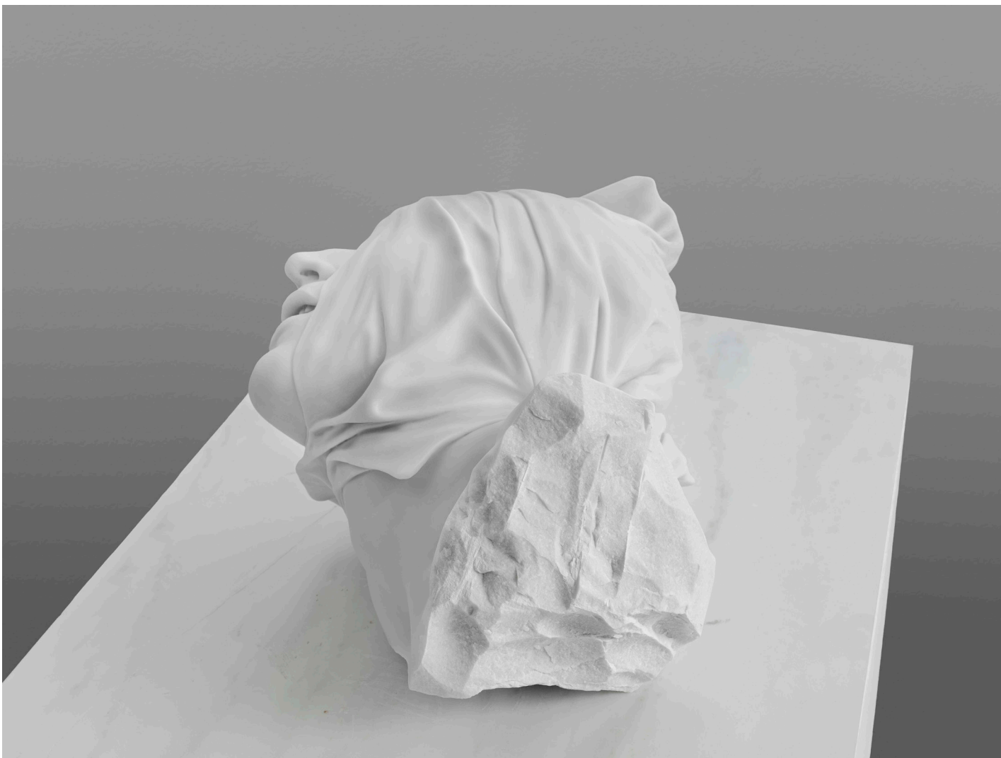
Reza Aramesh. "Action 608: At 5:06 am Tuesday 14 April 2015". 2025 Hand-carved and polished Bianco P marble. 55 × 33 × 28 cm (Image 4/4)