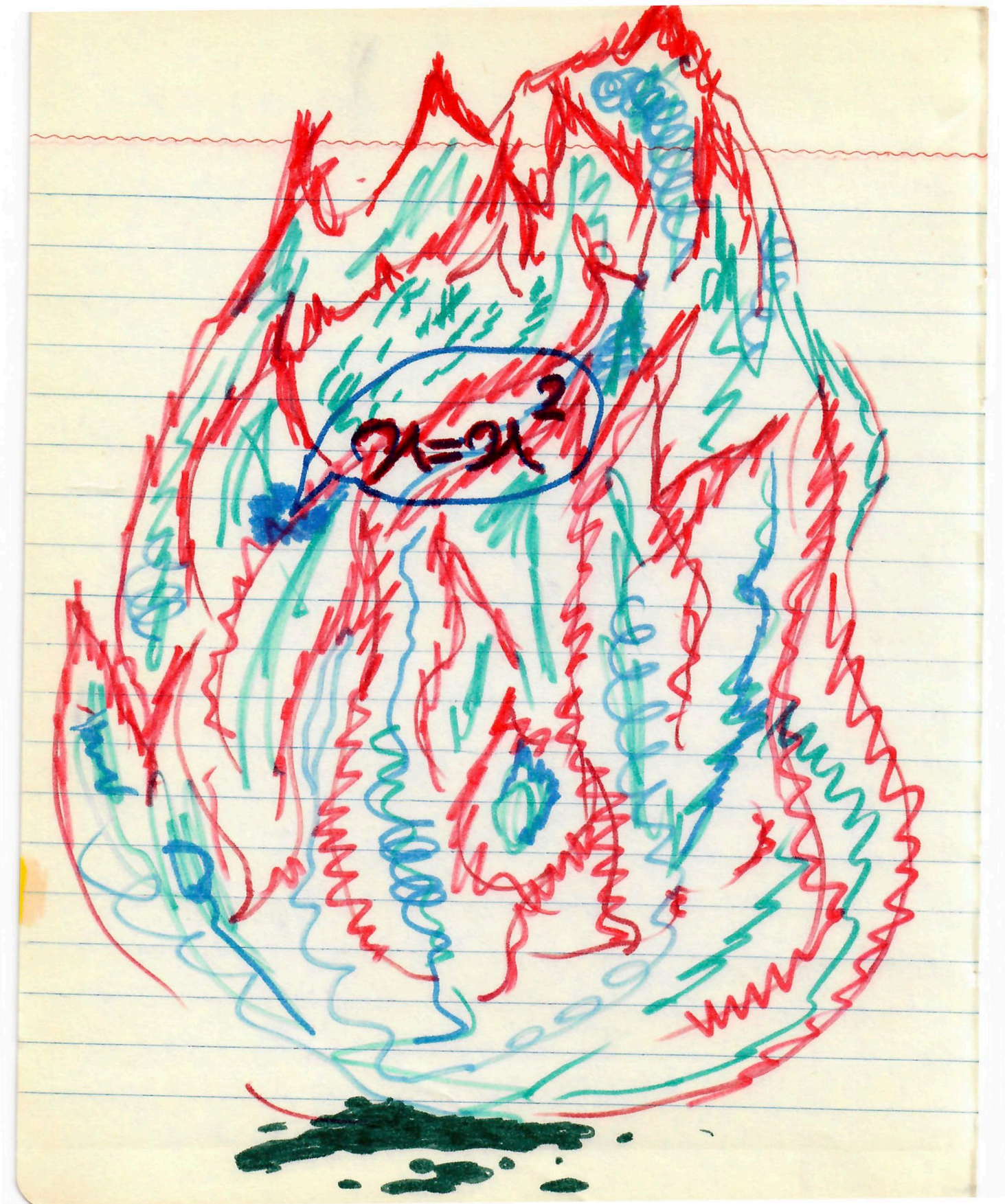
Nariman Farrokhi. Untitled, from "Page 1 of 1" series. 2018. Marker on Notebook Paper. 22x17cm.