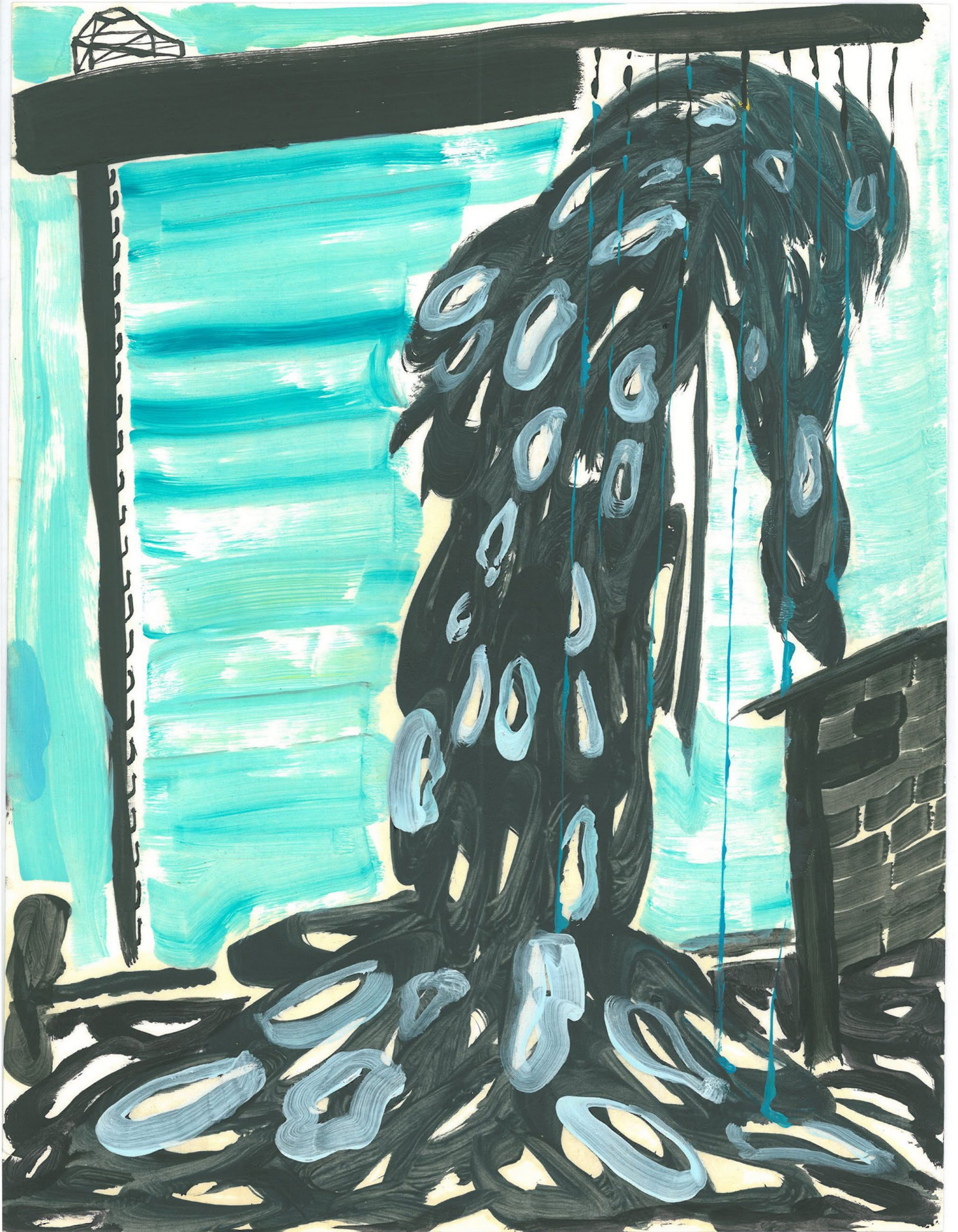
Nariman Farrokhi. Untitled. 2018. Oil on Paper. 33x25cm.