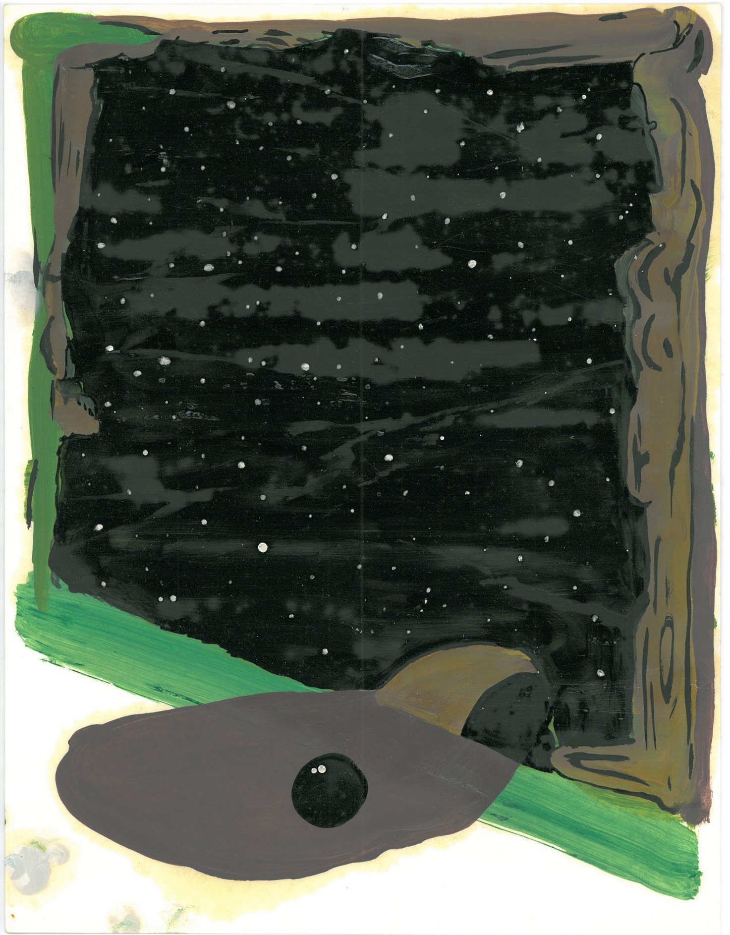
Nariman Farrokhi. Untitled. 2018. Oil on Paper. 33x25cm.