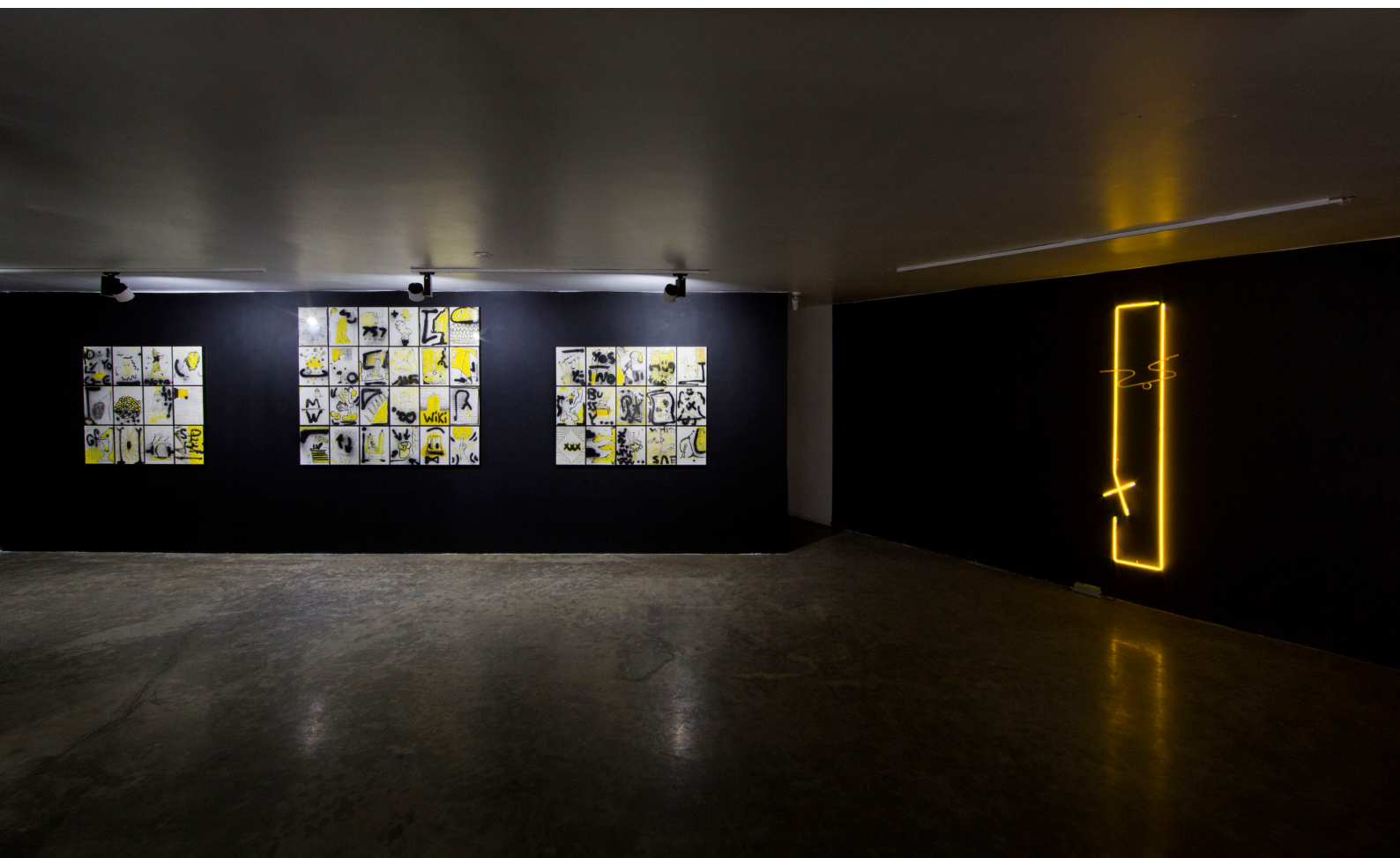
Installation View of Nariman Farrokh's "Black and Yellow" Exhibition at Dastan's Basement. 2017, Tehran, Iran