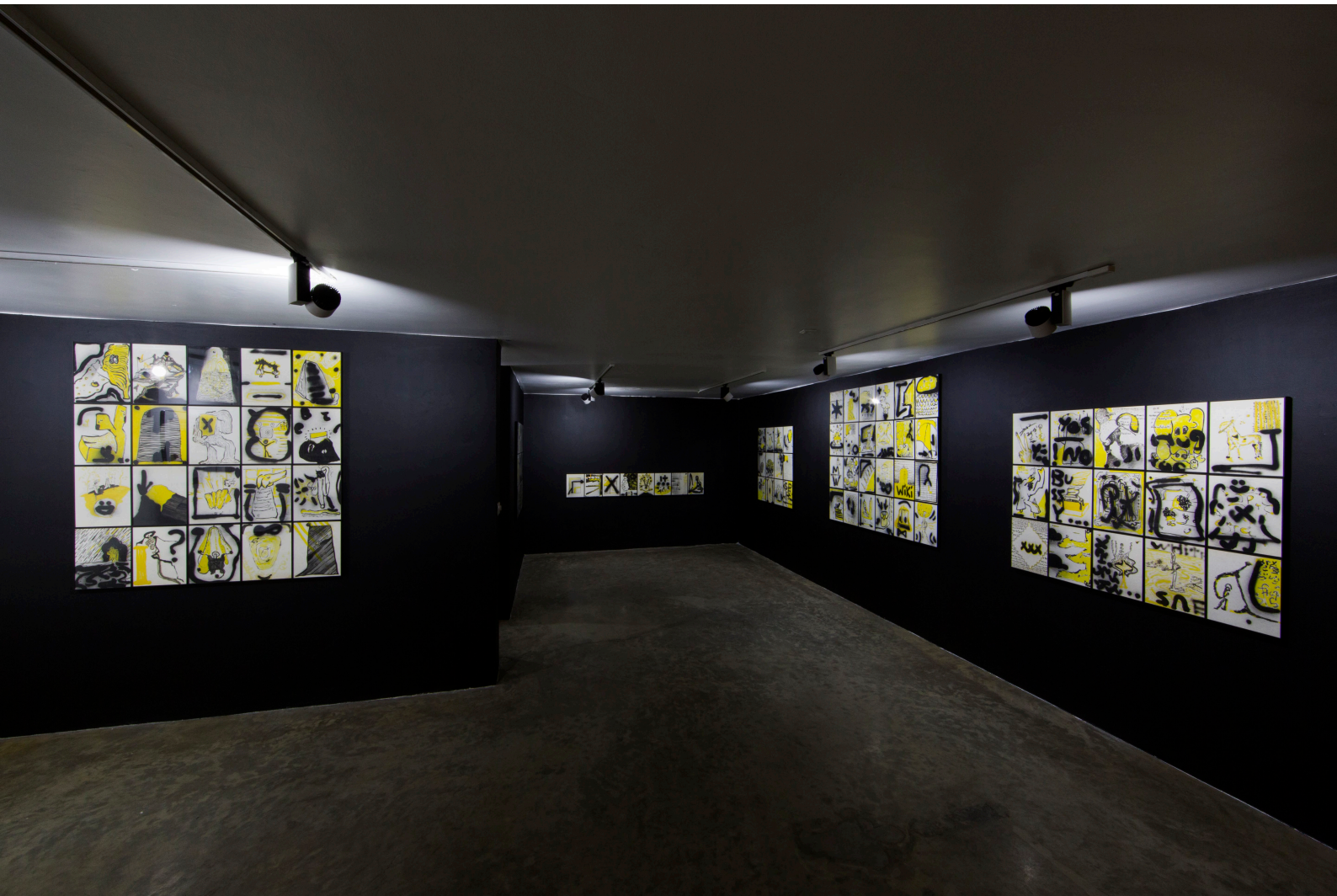
Installation View of Nariman Farrokhi's "Black and Yellow" Exhibition at Dastan's Basement. 2017, Tehran, Iran